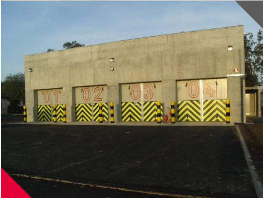
Rhino-FC Folding Door