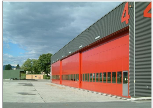
Rhino-SC Sliding door